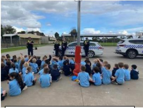
Thanks Swan Hill Police for the visit