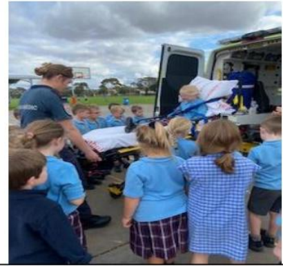
Thanks to St Johns Ambulance for the visit