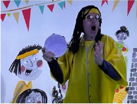
"All of his costumes made me laugh!"