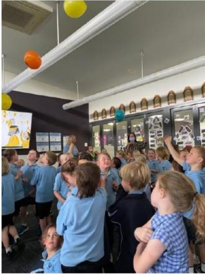
"The book was so interesting I wanted to watch it again!"