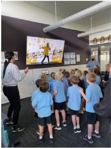
"We danced so much and copied all his funny actions"