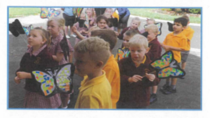
Catholic Education Office Ballarat 5 Lyons Street South Ballarat Vic 3350